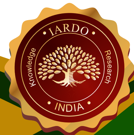
Coordinator, IARDO Bangkok Chapter