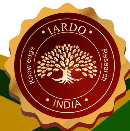
Coordinator, IARDO Bangkok Chapter