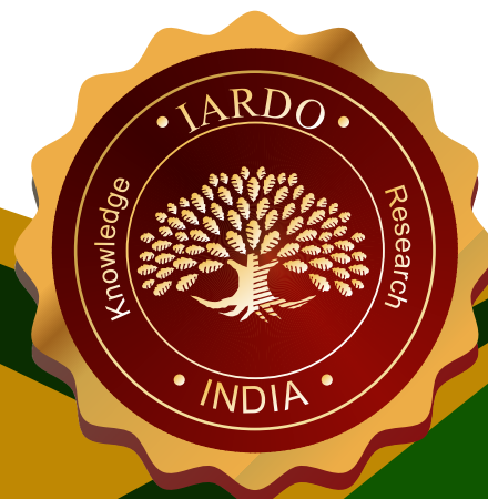
Coordinator, IARDO Bangkok Chapter